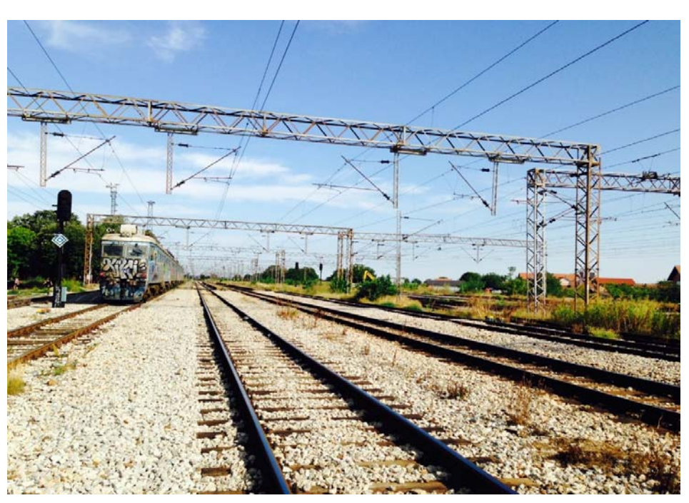
View of Orient/East-Med Corridor (CX) from Batajnica, Belgrade.