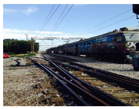
Passenger train stationed in Batajnica Station.

Located at the crossroads of important international transport corridors, Serbia sought to improve freight efficiencies and capacities by creating intermodal transport facilities. The present investment project1 involves construction of an intermodal terminal in Batajnica, Belgrade, with rail access, road access, storage area for intermodal transport units, buildings for the terminal operator and customs authority, and parking places for road freight vehicles.