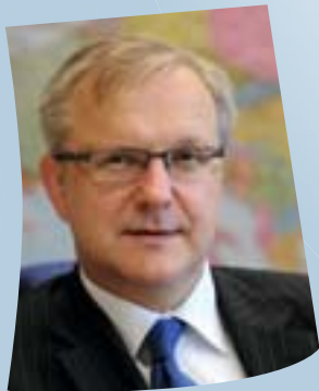
Olli Rehn Member of the European Commission Responsible for Enlargement