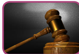
Governance and Rule of Law