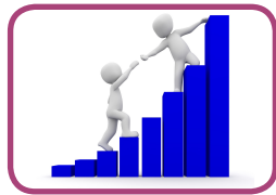
Fostering Growth and Job Opportunities

A Compact was annexed to the EU/Jordan Partnership Priorities, a document that sets out mutually agreed priorities for cooperation until 2018, focusing on: