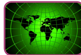
Regional Stability, Security and Countering Terrorism