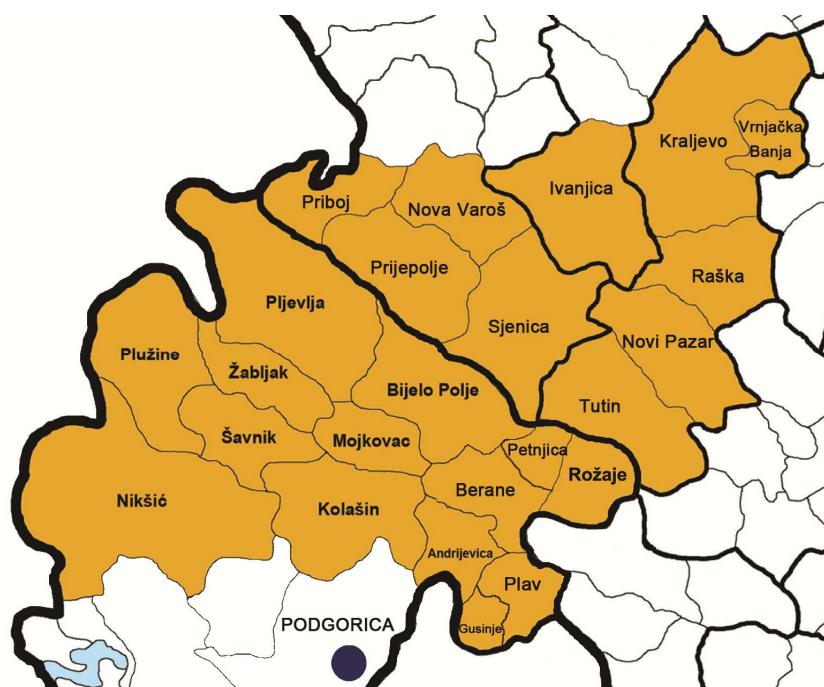
Map of the programme area

The programme area is predominantly mountainous with well-preserved nature. The most important nature resources include forests, water and mineral resources.