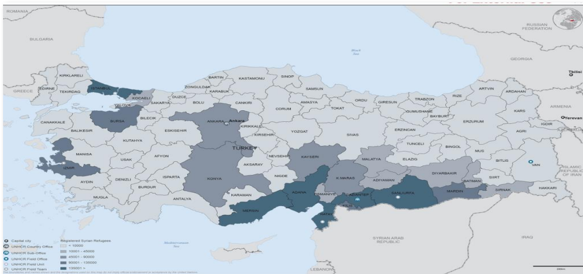
Provincial Breakdown of Syrian Refugees in Turkey

Turkey's geographical position makes it a prominent reception and transit country for many refugees and migrants. As a result of an unprecedented influx mainly due to the Syria conflict, the country has been hosting the highest number of refugees and migrants in the world, numbering more than 3 million. It includes 2.8 million registered Syrian refugees of which 10% reside in 26 camps established by the Turkish government in the south-east of Turkey, while the remaining 90% live outside of camps in urban, peri-urban and rural areas. To receive and host such high numbers of refugees and migrants, Turkey has been providing generous humanitarian and financial support.