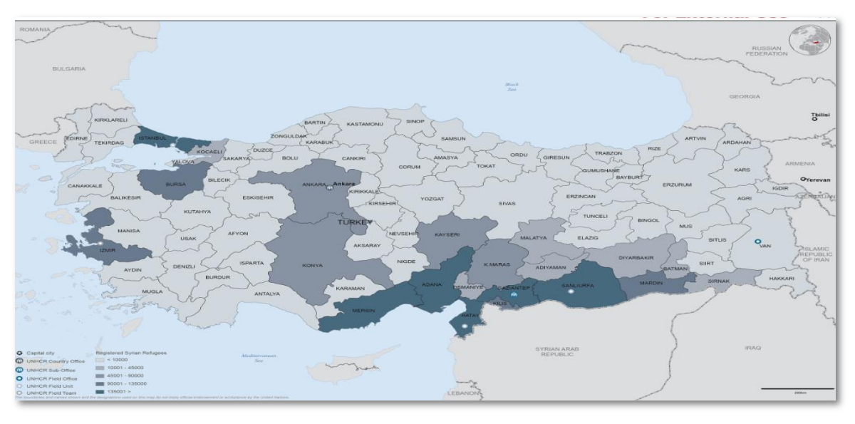
Provincial Breakdown of Syrian Refugees in Turkey

Turkey's geographical position makes it a prominent reception and transit country for many refugees and migrants. As a result of an unprecedented influx mainly due to the Syria conflict, the country has been hosting the highest number of refugees and migrants in the world, numbering more than 3 million. It includes 2.8 million registered Syrian refugees of which 10% reside in 26 camps established by the Turkish government in the south-east of Turkey, while the remaining 90% live outside of camps in urban, peri-urban and rural areas. To receive and host such high numbers of refugees and migrants, Turkey has been providing generous humanitarian and financial support.