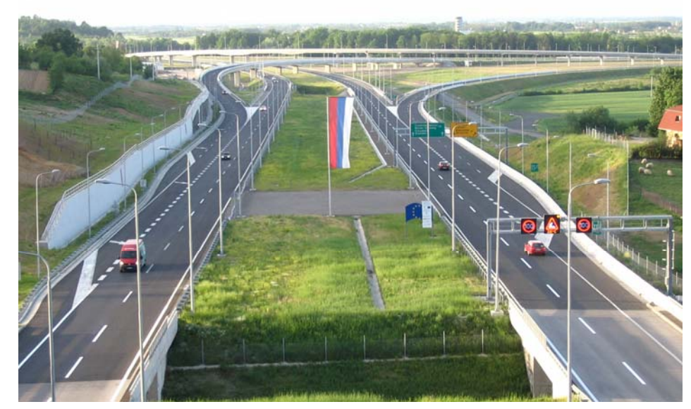
Upgraded interchange in Mahovljanska, Bosnia and Herzegovina.

<sup>1</sup> This investment project in Bosnia and Herzegovina is subject to a full assessment by the national investment committee in the beginning of September 2015.