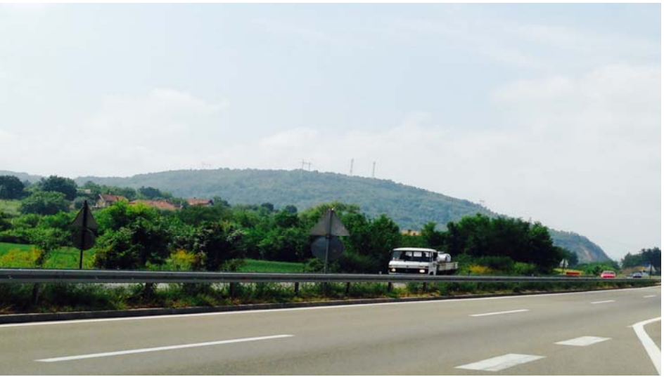
View of existing 400 kV transmission lines in Kraguevac.