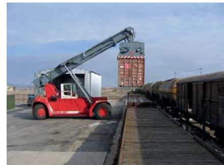
Freight transport on Route 10.

This investment project 1 will enable outdated switches, tracks and trackbed, culverts, bridges and tunnels along the Fushë Kosovë / Kosovo Polje – border with the former Yugoslav Republic of Macedonia route to be replaced or renovated.