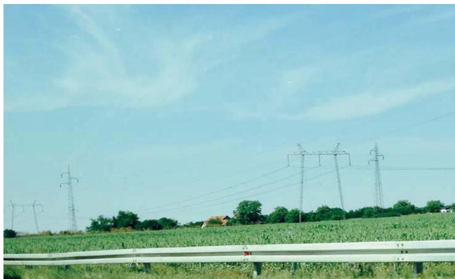
View of existing 110 and 400 kV transmission lines.

Bitola substation upgraded and new Ohrid substation built and operational.