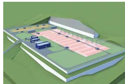
3D representation of the new 400/110/35 kV substation in Lastava.

The investments 1 in Montenegro comprise the construction of a new 400 kV transmission line from Lasta to Pljevlja and then to the border with Serbia, including the construction of a new substation in Lastva, the grid connection from Lastva substation to the existing 400kV Podgorica – Trebinje line, and the upgrade of the 400/220/110 kV substation in Pljevlja. The project include the cost of dismantling the existing 220 kV overhead lines between the substation in Pljevlja and the Montenegro/Serbia border.