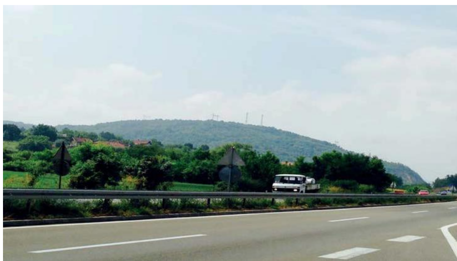
View of existing 400 kV transmission lines in Kragujevac.

Upgrade of the existing substation in Kraljevo (Kraljevo 3) to 400/220/110 kV.