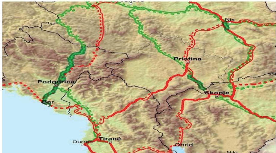
Map of Bar - Vrbnica route, Montenegro.

Estimated Loan Repayment Period: 15 years