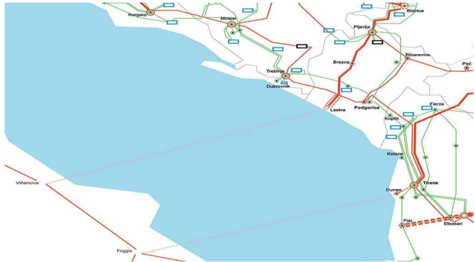
Existing and planned transmission corridors in Montenegro.

Estimated Loan Repayment Period: 12 years