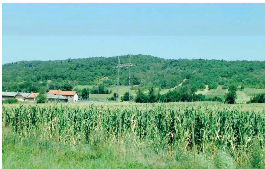
View of existing 400 kV transmission lines along the Trans-Balkan Corridor.

A new 400kV substation in Lastva and upgraded substation in Pljevlja.