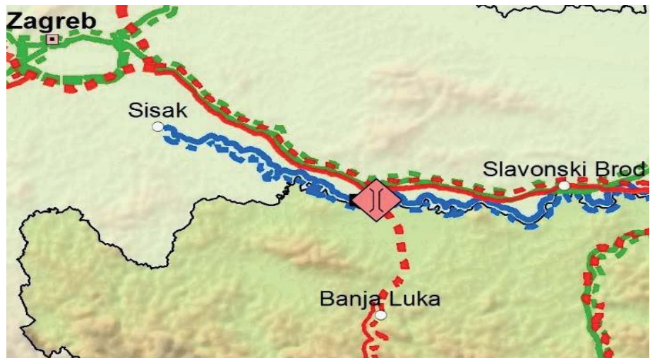
Map of Bosnia and Herzegovina – Croatia Section of Route 2a, with Gradiška Bridge.

Estimated Loan Repayment Period: 17 years