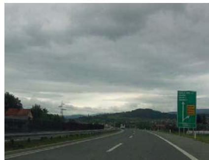
View of Corridor Vc in the vicinity of Sarajevo, Bosnia and Herzegovina.

This investment project 1 concerns the construction of a border crossing, a cross-border bridge over the River Sava, as well as 10 km of motorway on the Svilaj – Odžak section that is being built between Bosnia and Herzegovina and Croatia, along the Mediterranean Corridor (CVc).