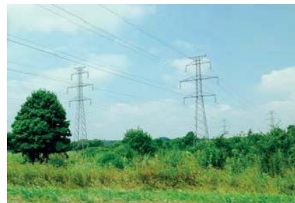
Low voltage transmission lines on the Kragujevac – Kraljevo route

The Kragujevac – Kraljevo section is on the list of Projects of Energy Community Interest, being located in one of the Energy Community Treaty Contracting Parties (Western Balkans countries, Moldova, and Ukraine). It will upgrade the electricity distribution system in Central and Western Serbia and interconnect it with systems in the neighbouring EU states.