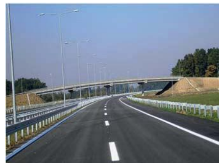
View of Banja Luka – Gradiška motorway, Bosnia and Herzegovina.

The present investment project 2 concerns the construction of a border crossing, a cross-border bridge over the River Sava, as well as motorway connections on the Banja Luka – Gradiška section.