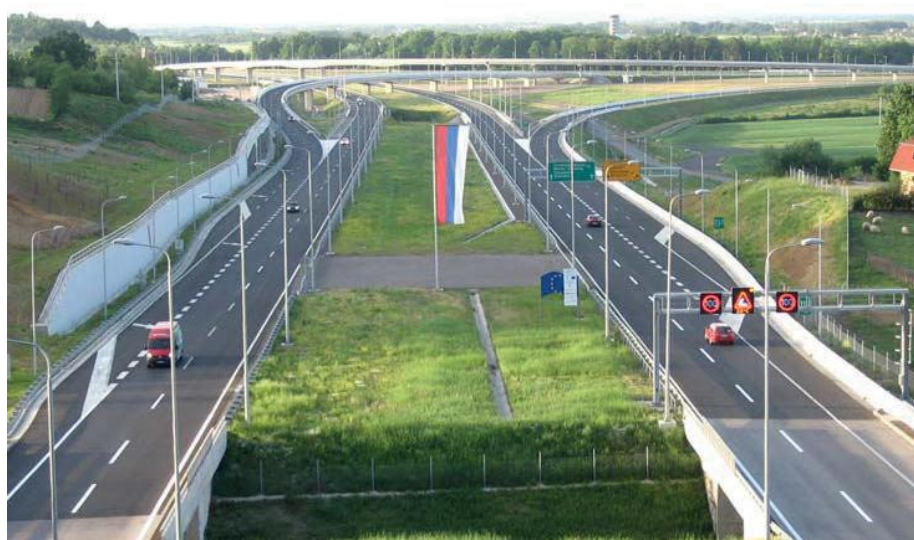
Upgraded interchange in Mahovljanska, Bosnia and Herzegovina.

Completion of the Banja Luka – Gradiška motorway section, including the cross-border areas. Modern and efficient border crossing facilities on the Banja Luka – Gradiška section of the Mediterranean Corridor (R2a). Cross-border bridge in Gradiška.