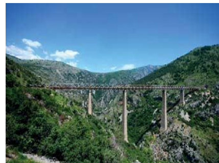
View of the longest bridge on the Podgorica – Bar railway line, on Mala Rijeka.

With this investment project 1 , signalling systems covering approximately 9 km of line will be replaced in Podgorica, and about 5.3 km of bridges on the Vrbnica – Bar section will be renovated.