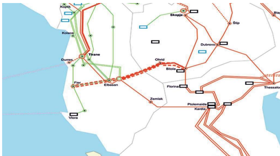
Albania – the former Yugoslav Republic of Macedonia electricity transmission interconnections.

Estimated Loan Repayment Period: 11 years