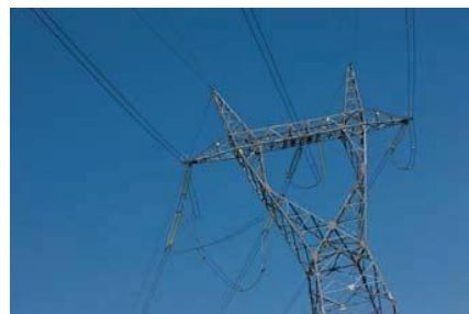
Existing 400 kV lines in the former Yugoslav Republic of Macedonia

Investments 1 in the former Yugoslav Republic of Macedonia include a 400 kV transmission system from Bitola to Ohrid and from there to the border with Albania. It will thus complete the 400 kV electricity ring between Albania, the former Yugoslav Republic of Macedonia and Greece.