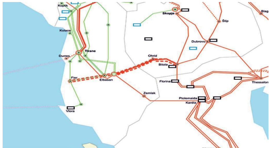
Albania – the former Yugoslav Republic of Macedonia Power Interconnections.

Estimated Loan Repayment Period: 12 years