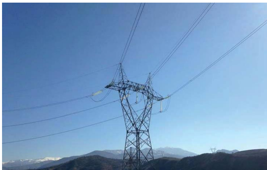
Existing 400 kV transmission lines in Elbasan, Albania.