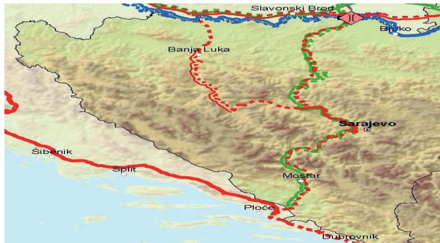
Map of Bosnia and Herzegovina – Croatia Section of the Mediterranean Corridor (CVc).

The road network in Bosnia and Herzegovina covers more than 8,000 km, more than 1,000 km of which are European routes. Most of this network has been designed to accommodate a two-way single carriageway with a maximum speed of 80kph. Traffic lane width varied from 3.50 to 3.75m, and road shoulders from 0.5 to 1m wide. As average daily traffic volumes grew to over 9,700 vehicles, with a corresponding increase in freight volumes, Bosnia and Herzegovina embarked on a motorway construction programme in cooperation with its neighbours. It has been actively supported by the European Union and its partners, particularly under the Western Balkans Investment Framework.