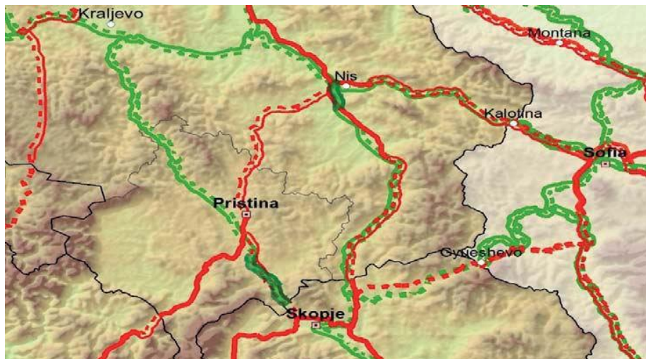
Map of the Orient/East-Med Corridor (R10).

The Orient/East-Med Corridor (R10) is 256 km long, out of which 148 km are in Kosovo. It connects Kraljevo (Serbia) to Pristina (Kosovo) and Gorce Petrov (the former Yugoslav Republic of Macedonia). The first railway tracks were built in 1936 and the route was regularly maintained until the 1990s. No major investment has been made since then.