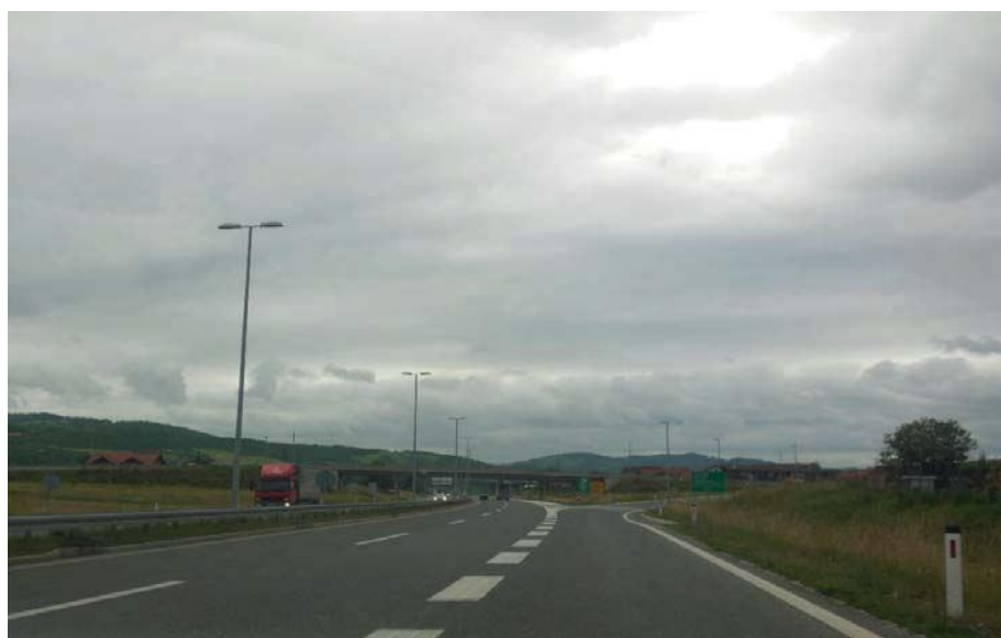
Upgraded interchange on Corridor Vc, Bosnia and Herzegovina.

Completion of the Svilaj – Odžak motorway section, including the cross-border areas.