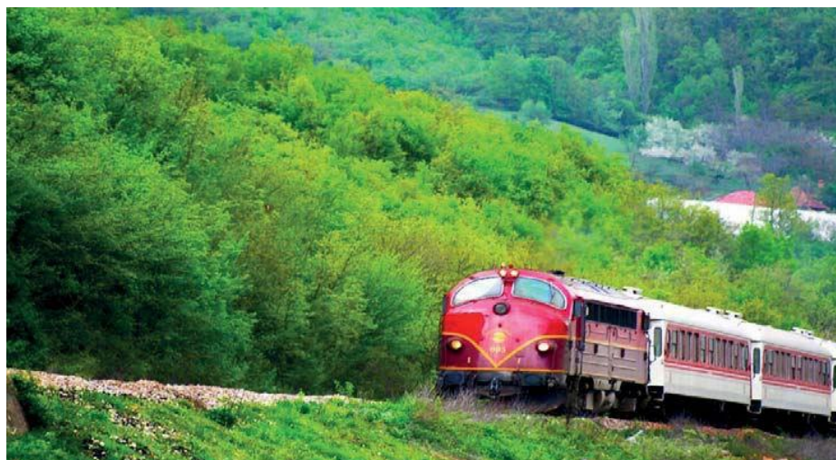
Passenger transport on Railway Route 10, close to Fushë Kosovë / Kosovo Polje.

Approximately 64 km of railway track fully rehabilitated.