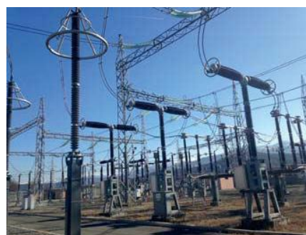
Modern substation in Elbasan, Albania.

In Albania a 400 kV transmission system will connect Fier to Elbasan and from there to the border with the former Yugoslav Republic of Macedonia. Two substations will be upgraded as part of the project 1 .