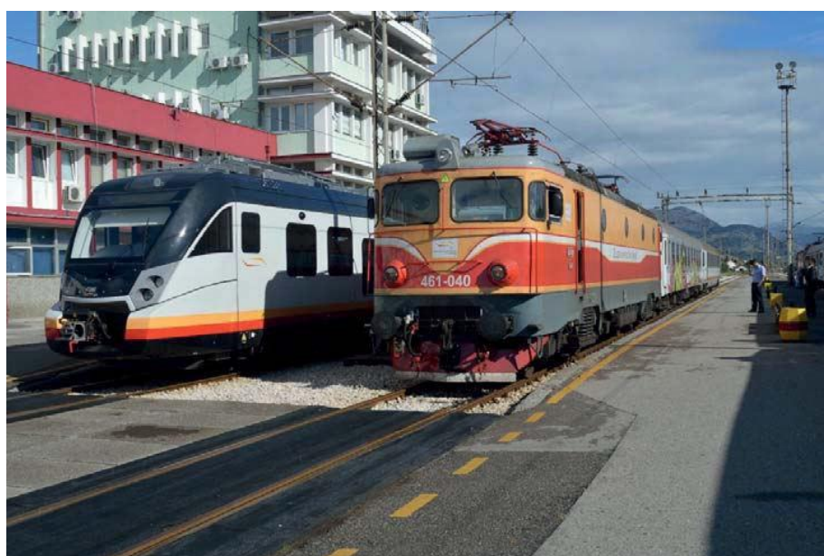
Old and new passenger fleet in Podgorica Station, commuting between Belgrade and the Port of Bar.

Completion of a multimodal maritime-rail transport route from the port of Bar to the wider Western Balkans region.