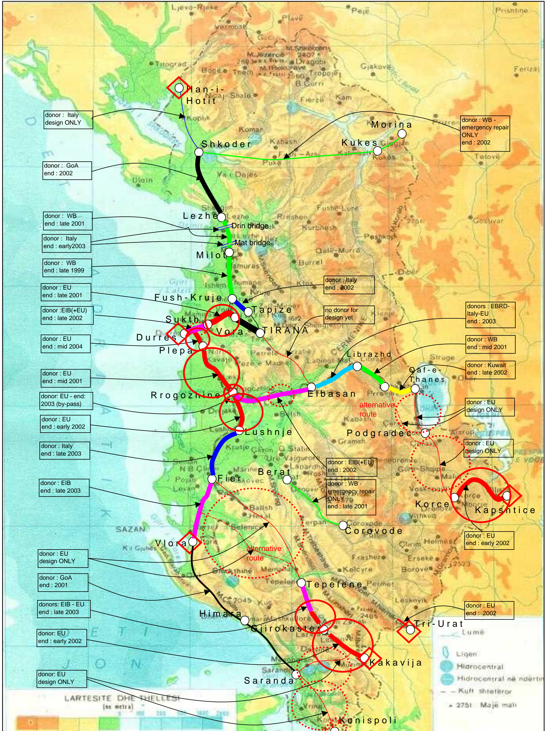
ALBANIA ROAD MAP - SITUATION OF THE MAIN ROAD CONSTRUCTION PROJECTS BY 06/2001