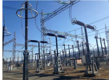
Modern substation in Elbasan, Albania.

In Albania a 400 kV transmission system will connect Fier to Elbasan and from there to the border with the former Yugoslav Republic of Macedonia. Two substations will be upgraded as part of the project 1 .