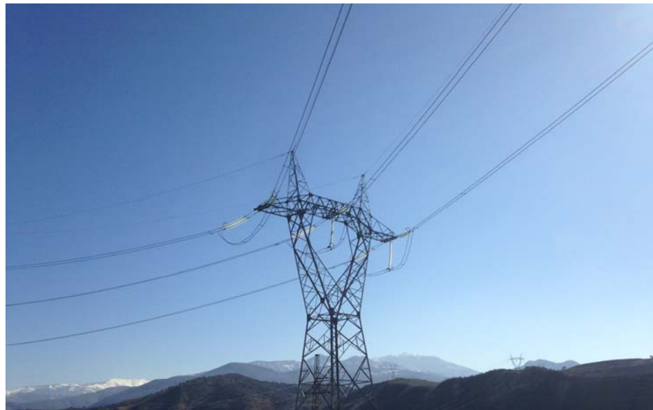
Existing 400 kV transmission lines in Elbasan, Albania.